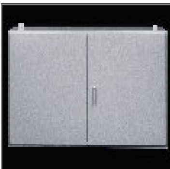
NEMA 12 Double Door Wall Mount