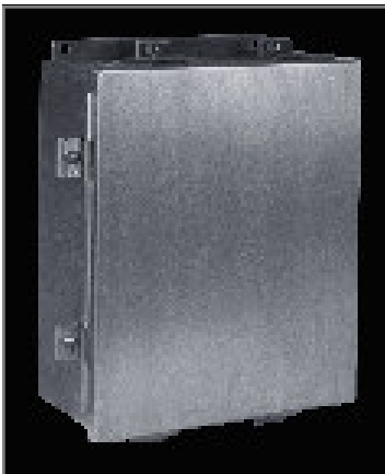
NEMA 4X Clamp Cover