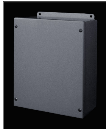
JIC Screw Cover