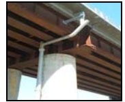
FIBERGLASS BRIDGE DRAIN SYSTEMS