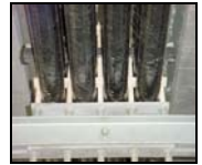
BRIDGE ATTACHMENT HANGERS & SUPPORTS