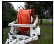
DISTRIBUTOR OF OUTSIDE PLANT AND UTILITY PRODUCTS