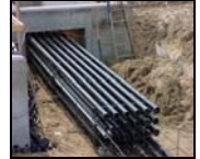
BELOW GROUND CONDUIT SYSTEMS