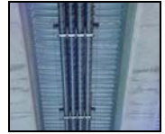
UNDER BRIDGE CONDUIT SYSTEMS

DESIGN * FURNISH * INSTALL ONE CALL - (800) 905-7506