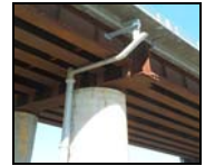
FIBERGLASS BRIDGE DRAIN SYSTEMS