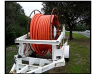
DISTRIBUTOR OF OUTSIDE PLANT AND UTILITY PRODUCTS