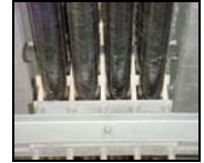
BRIDGE ATTACHMENT HANGERS & SUPPORTS