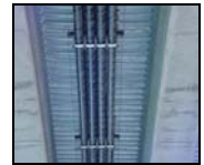
UNDER BRIDGE CONDUIT SYSTEMS