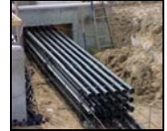
BELOW GROUND CONDUIT SYSTEMS