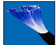
FIBER OPTIC CABLE FIBER-SPlicing FIBER TESTING FIBER DOCUMENTATION