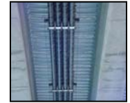
UNDER BRIDGE CONDUIT SYSTEMS

DESIGN * FURNISH * INSTALL ONE CALL - (800) 905-7506