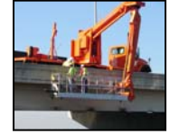
TURN-KEY CONSTRUCTION SERVICES