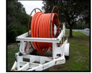
DISTRIBUTOR OF OUTSIDE PLANT AND UTILITY PRODUCTS