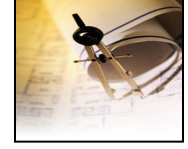
DESIGN ENGINEERING AND PERMITTING