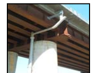
FIBERGLASS BRIDGE DRAIN SYSTEMS