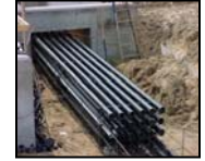
BELOW GROUND CONDUIT SYSTEMS