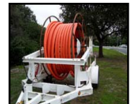
DISTRIBUTOR OF OUTSIDE PLANT AND UTILITY PRODUCTS