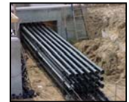
BELOW GROUND CONDUIT SYSTEMS