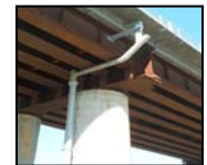
FIBERGLASS BRIDGE DRAIN SYSTEMS