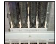
BRIDGE ATTACHMENT HANGERS & SUPPORTS