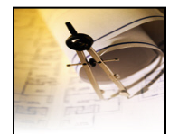
DESIGN ENGINEERING AND PERMITTING