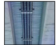
UNDER BRIDGE CONDUIT SYSTEMS

DESIGN * FURNISH * INSTALL ONE CALL - (800) 905-7506