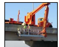
TURN-KEY CONSTRUCTION SERVICES