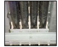
BRIDGE ATTACHMENT HANGERS & SUPPORTS