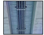
UNDER BRIDGE CONDUIT SYSTEMS

DESIGN * FURNISH * INSTALL ONE CALL - (800) 905-7506