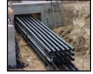
BELOW GROUND CONDUIT SYSTEMS