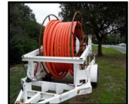
DISTRIBUTOR OF OUTSIDE PLANT AND UTILITY PRODUCTS