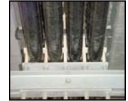
BRIDGE ATTACHMENT HANGERS & SUPPORTS