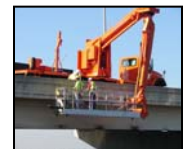
TURN-KEY CONSTRUCTION SERVICES